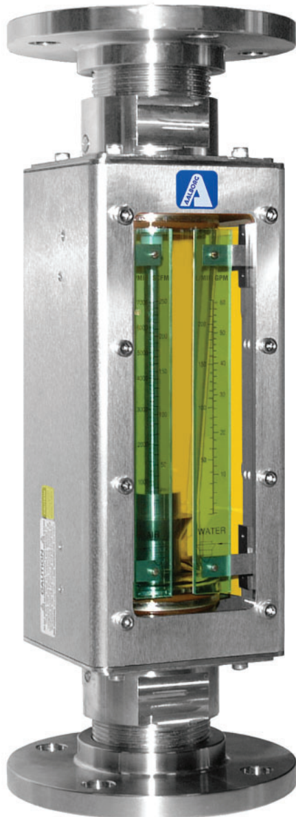
Flanged M Style Meter

Heavy-duty flow meters are fully enclosed in a brushed stainless steel case. Ideal for industrial applications with flow rates of up to 116 GPM / 440 L/min and 250 SCFM / 7080 L/min. Used for flow measurements of liquids (water) and gases (air).