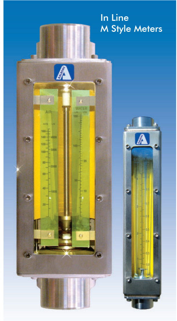
In Line M Style Meters

Meters are graduated for direct reading of water and air. Flow meters come with FNPT or flanged end fittings for easy in-line installation. Wetted parts include borosilicate glass flow tubes, Viton® o-rings, and 316 Stainless steel fittings, guide rods, floats and float stops.